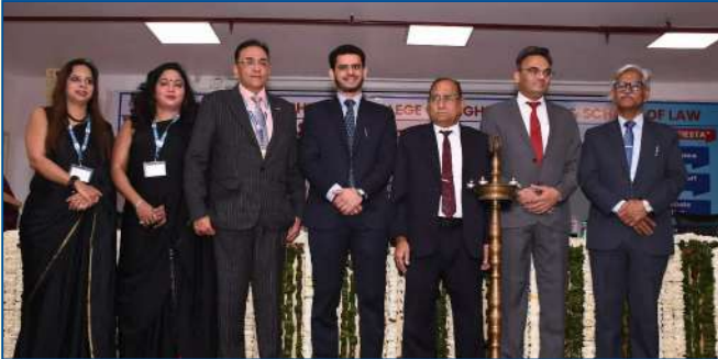
Lamp Lighting in the Inaugural Ceremony

Theme: "Social & Welfare Laws: Emerging Challenges & Solutions" (March 01-02, 2024)