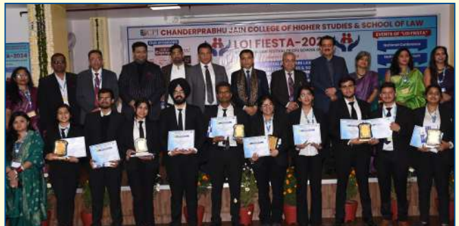
Winners of all the Competitions with the Esteemed Guests at the Valedictory Ceremony