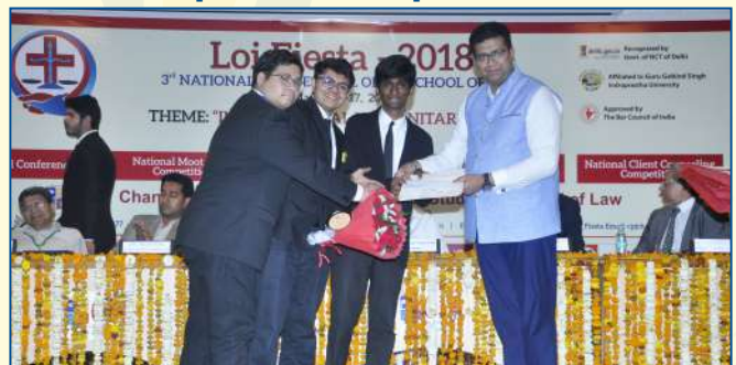
Moot Court Winners being Awarded in Felicitation