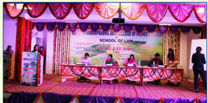
National Seminar in Progress