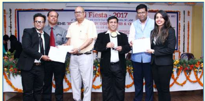
Moot Court Winners being awarded in Felicitation