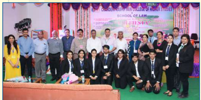
Organizers with Guests