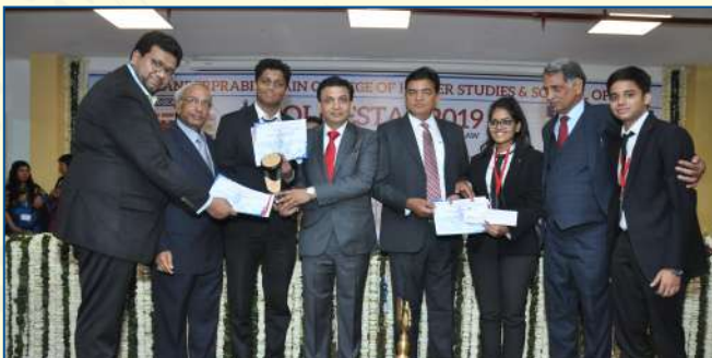
Moot Court Winners being Awarded by Guests in the Valedictory Ceremony