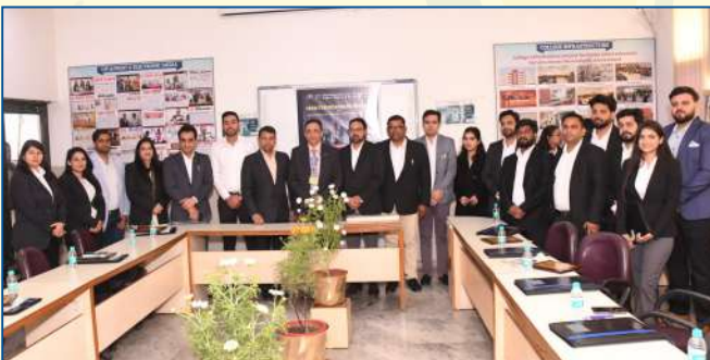
Felicitations of Judges of National Moot Court Competition