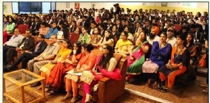
Glimpse of Audience @ LOI FIESTA 2017