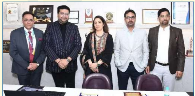
With the Judges of National Client Counseling & National Debate Competitions