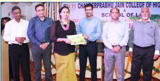
Felicitation of Participants