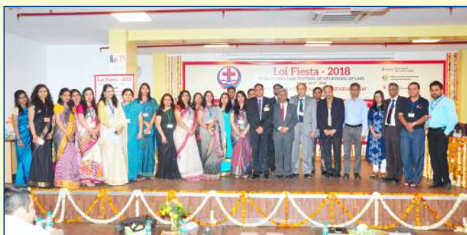
Guests & Sol Team at Valedictory Session of National Conference